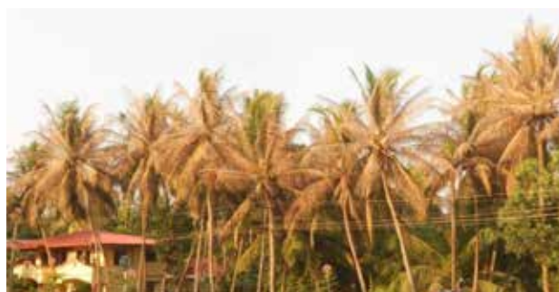
Black headed caterpillar-infested field

The recent invasion of the exotic Rugose Spiralling Whitefly in coconut ecosystem from Tamil Nadu and Kerala had initially alarmed plantation sector. However, the conservation biological control strategy resorting to no pesticide spray by ICAR-Central Plantation Crops Research Institute turned out to be a success.