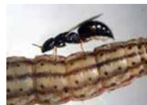
G. nephantidis parasitising black headed caterpillar