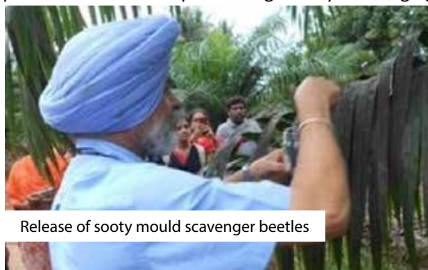
Release of sooty mould scavenger beetles

The bio-cleansing action was prompt, sharp and timely in a niche that was experiencing pesticide holiday with no pesticide residue as well. This favoured build up of the scavenger beetle in a short period of time and performing timely scavenging