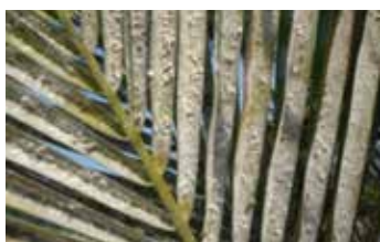
RSW colony on infested palm leaf