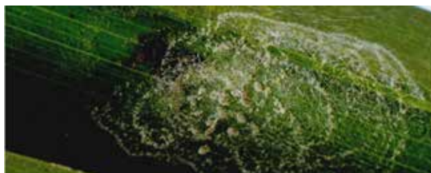
Leaf bit containing E. guadeloupae parasitized RSW pupae used in augmentative biological control

When A. dispersus was introduced during 1993 on cassava ( Manihot esculenta ), several approaches adopted to combat the pest, including use of insecticides, failed to suppress the pest population at the initial phase of introduction. However, with the advent of the aphelinid parasitoids, Encarsia