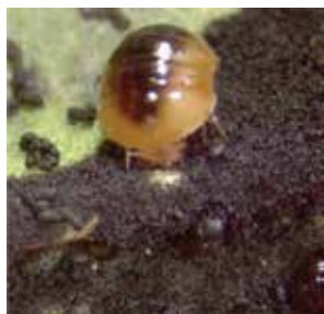
Pre-pupa of L. nilgiranus