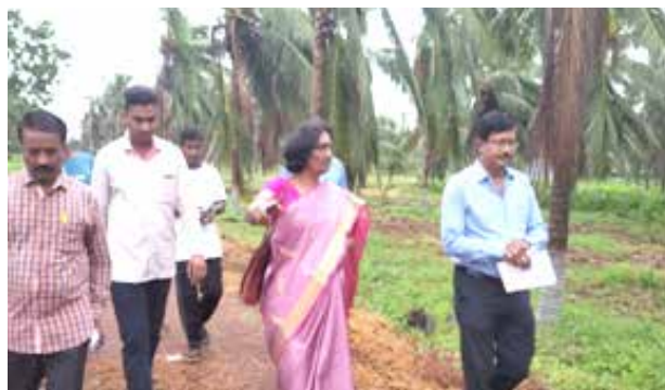
Smt.V. Usha Rani, IAS Chairperson, CDB visited DSP Farm, Pitapally on 3 rd September 2019. Chairperson reviewed the activities of the Farm and had interaction with the officials of the Farm. She also planted a coconut seedling in the Farm premises.