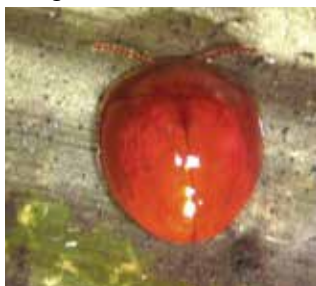
Adult tenebrionid beetle