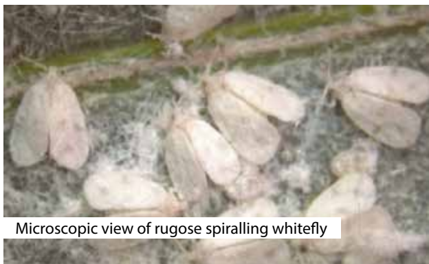
Microscopic view of rugose spiralling whitefly