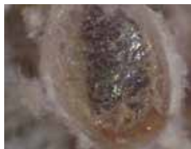
Parasitized RSW pupa

whitefly ( Aleurodicus dispersus Russell) and rugose spiralling whitefly ( Aleurodicus rugioperculatus Martin) is noteworthy and highlighted in this article.