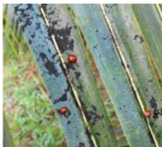
Scavenging action by L. nilgiranus