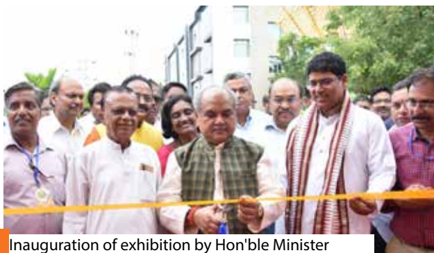
Inauguration of exhibition by Hon'ble Minister