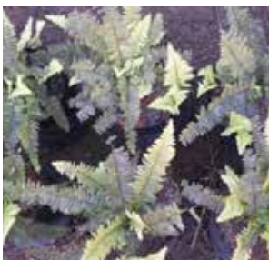
Sooty mould on intercrops

on the planting materials they carry by adopting strict quarantine measures including at domestic level.