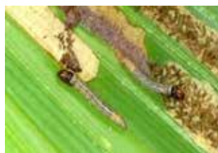
Black headed caterpillar