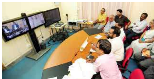
Video conferencing system at CPCRI

Coconut Development Board has initiated an innovative training programme viz., 'Friends of Coconut Trees (FoCT)' to develop a professional group of youth for harvesting and plant protection operations in coconut. The training targeted the group of unemployed youth in developing technical skills, entrepreneurship capacity, leadership qualities and communication skills to address the needs of the coconut growers. KVKs functioning