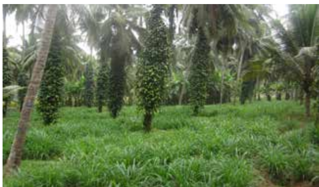
Fig.6. Grass under coconut

suit the farmers' needs, availability of resources like labour, rainfall, irrigation facilities, finance etc., soil characteristics and market demand. The crops found suitable for cultivation as subsidiary crops in coconut gardens include tuber crops, rhizome spices, cereals, pulses, oilseeds, fruit crops, vegetables, and medicinal and aromatic plants among the annuals and beverage crops and spices among the perennials. The research effort of ICAR-CPCRI has resulted in the development of technologies for coconut based intercropping, multi-storied, high density multi-species cropping systems and these are being widely adopted by the farmers. The high density multi-species cropping system and coconut-based mixed farming system, involving annuals/biennials/perennials grown in different tiers by exploiting soil and air space more efficiently and integrating with poultry and animal husbandry, help to maximize profits and can even buffer the price crash of the main crop. The crops selected for a cropping system should be compatible with the main crop and it should have local demand.