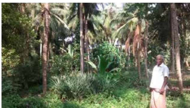
Demonstration on coconut based cropping/farming system