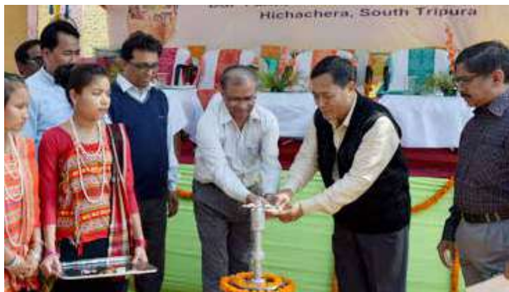
Shri. Jitendra Chaudhury, Hon'ble Member of Parliament inaugurating the awareness programme.