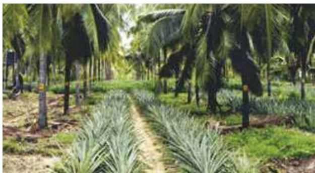
Fig.5. Pineapple under coconut