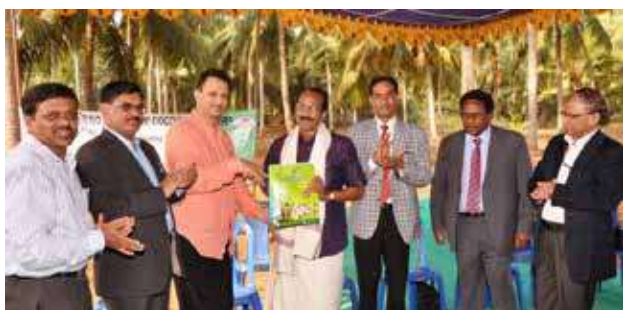
Honoring Innovative farmers at CPCRI