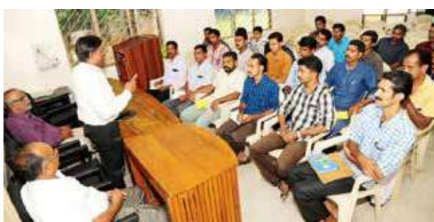
Training for Friends of Coconut Trees ( FoCTs)