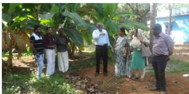
Demonstration on soil and water conservation measures