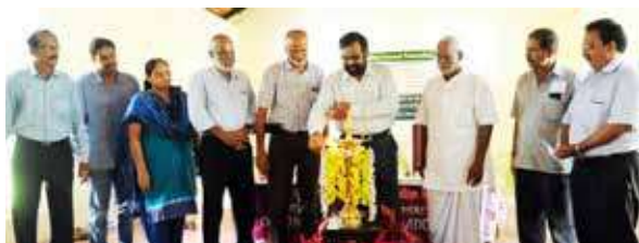
R- E-F interface at Manjeswar, Kasaragod