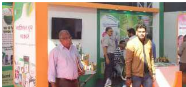
Board's stall in Krishi Unnathi Mela