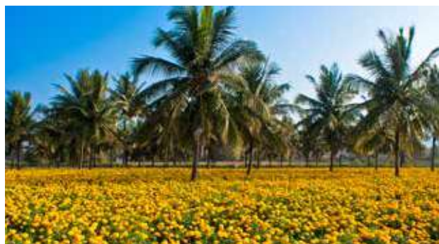
Fig.2. Oranmental crops under coconut as intercrop