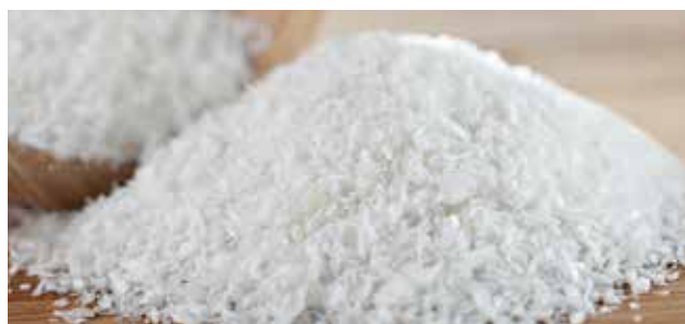
Table 10: Weekly price of desiccated coconut in October 2016

The FOB price of desiccated coconut in India during the month of February was very competitive compared to the prices of major DC exporting countries.