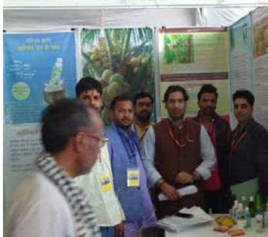
Board's stall in Gramodaya Mela