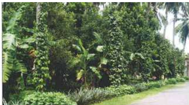
Fig.3. Coconut based high density multiple cropping system