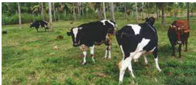
Fig.7. Dairy unit associated with coconut

(Andhra Pradesh) also, the HDMSCS with cocoa+ banana+vegetables+ pineapple resulted in realizing higher income (Rs. 2.75 lakhs/ha), whereas, mono crop recorded only Rs.1.25 lakhs/ha indicating the financial advantage of HDMSCS over mono cropping coconut.