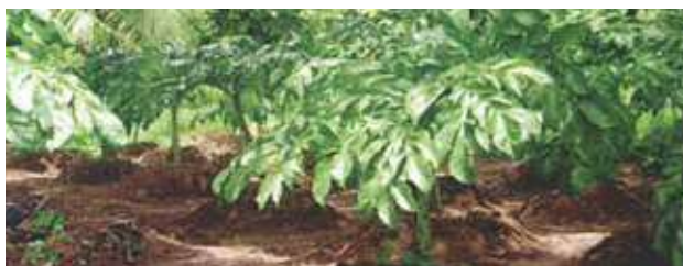
Fig.9. Tuber crops under coconut

The littoral sandy soil constitute a major portion in the coconut growing regions. Fodder grass (Hybrid Bajra Napier ,Co3- 92 t/ha/year), vegetable crops (cowpea-6 t/ha, ridge gourd-9 t/ha, snake gourd- 8t/ha), pumpkin-10.12 t/ha and ash gourd-(9.2 t/ha), tuber crops (elephant foot yam- 20t/ha)) and fruit crops (banana and pineapple-15t/ha)) could be successfully grown as intercrops in coconut gardens under coastal sandy soil by adopting appropriate soil moisture conservation measures viz., opening of trenches/ pit depending upon the crops chosen and incorporation of one layer of coconut husk in the bottom of this trench/pit with its