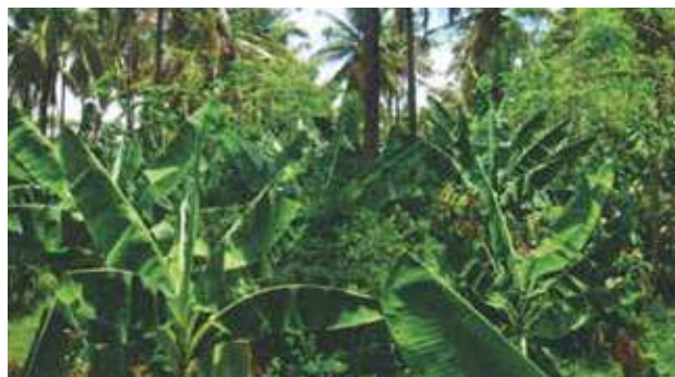
Fig.4. Banana as inter crop

in the top 0-120 cm of which 18.9 % and, 63 % of roots are confined to top 0-30 cm and 31-90 cm depth, respectively. Making use of the underutilized soil space and solar radiation in pure stands, a variety of crops having different stature, canopy shape and size and rooting habit can be inter planted to form compatible combinations.