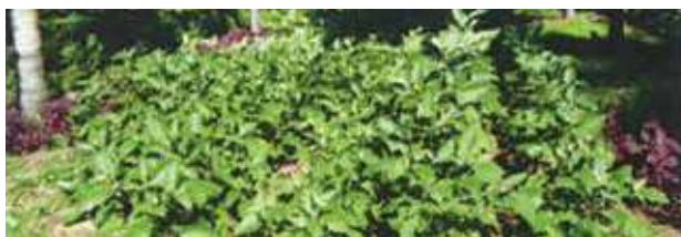
Fig.9. Vegetable under coconut

concave surface facing planting zone and this husk layer is covered with organic manure which is covered by soil. The yield of coconut could be increased from initial level of 40 nuts/palm to 120 nuts/palm under coconut + vegetable intercropping system followed by coconut + pineapple (107 nuts/palm), coconut + fodder grass (102 nuts/palm) and mono cropping (98 nuts/palm) during 2014-15. The economic advantage of the system under coastal sandy soil is that all the cropping systems had realized higher net returns as compared to mono crop. The net returns ranged from Rs. 0.46 lakh/ha/year in case of coconut mono crop to Rs. 1.13 constitute a major portion in the coconut growing regions. Fodder grass (Hybrid Bajra Napier, Co3- 92 t/ha/year), vegetable crops (cowpea-6 t/ha, ridge gourd-9 t/ha, snake gourd-