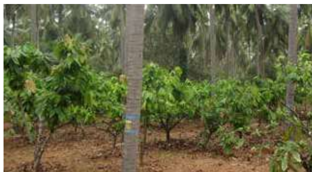
Fig. 1. Cocoa under coconut as a understory crop

Studies have revealed that planting method and growth habit of sole coconut palms at the recommended spacing of 7.5 m x 7.5 m make use of only 22.3% of land area effectively while the average air space utilization by the canopy is about 30% and solar radiation interception is 4550%. However, the effective root zone of the adult palm is confined laterally within a radius of 2 m around the base of the palm and over 95% of roots are found