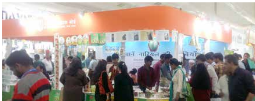
Board's stall in Aahar 2017

A B2B was conducted on the 4 th day of the Fair at