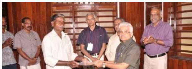
Honouring winners in Quiz competition

production of quality copra using copra dryers, coconut kernel based food products, preparation of coconut candies, production of Snow Ball Tender Nut, production of coconut chips, Oyster mushroom cultivation on coconut wastes and production of vermicompost using coconut leaves etc were included.