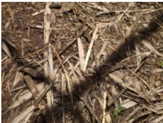
Vermicompost Pit Filled with chaffed material