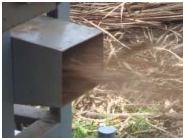
Chaffed Material from Shredder Outlet