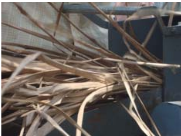
Feeding Coconut Fronds to Shredder

The chaffed material of around 400 kg was put into compost pit of size 7.5 x 1.5 x 0.5 m (on an average 70 kg of material can be put into one cum). On this material, cow dung slurry (10 kg of cow dung