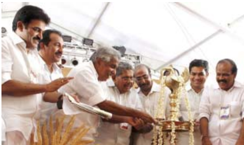
Shri. Oommen Chandy, Chief Minister, Kerala inaugurating Coir Tech Expo

Coconut Development Board, Regional Office, Bangalore participated in Food and Hospitality World - 2012 exhibition, held at Tripura Vasini, Palace Grounds, Bengaluru from 21 st June to 23 rd June 2012. Shri. Shrikantadhatha Odayor, Maharaja of Mysore inaugurated the exhibition. Board showcased various value added coconut products like coconut oil, virgin coconut oil, packed tender coconut water, desiccated coconut powder, coconut milk powder, coconut based vinegar and coconut water concentrates. Handicraft items made out of coconut wood and shell were also displayed in the Board's stall.