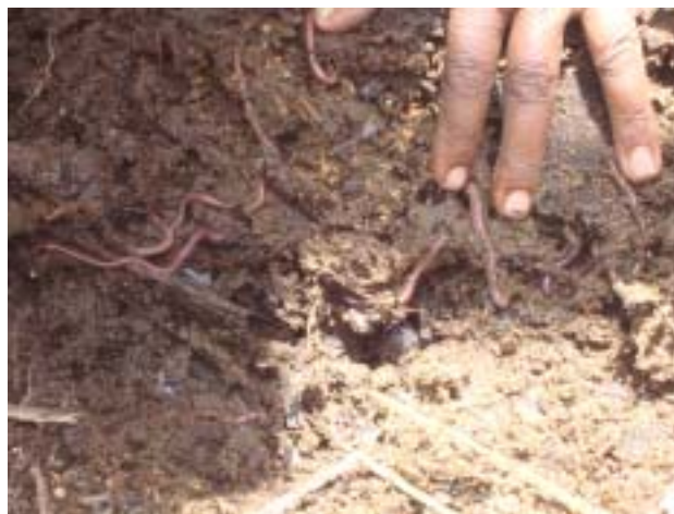
Chaffed Coconut Frond being subjected to action of Earthworms