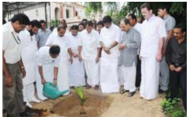
Shri Mullapally Ramachandran, Minister of State for Home Affairs, planting the seedling at the premises of Kerala House

his welcome address spoke on the importance of the crop in Indian culture and economy. Packed