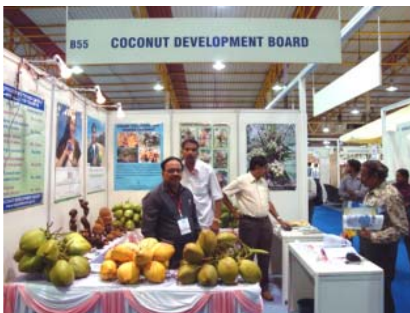
A view of the Board's Stall in Hospitality World

coir jackets, umbrella, bags, slippers and ornaments. Delegates from abroad, from Tamil Nadu, Andhra Pradesh, Odisha and Karnataka participated in the exhibition. Coconut Development Board had its display cum sales counter in the coir tech expo.