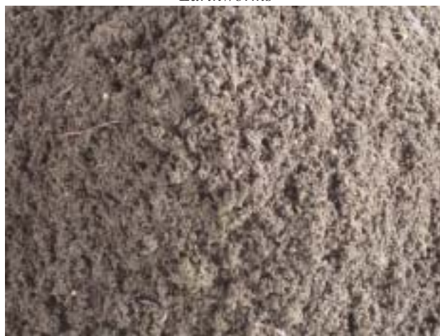
Final Product of Vermicomposting

in 100l of water) was sprinkled and kept for 8-10 days. After the incubation period, 2.5 kg of earthworms were released in to the pit at 3-4 spots. Later on cow dung