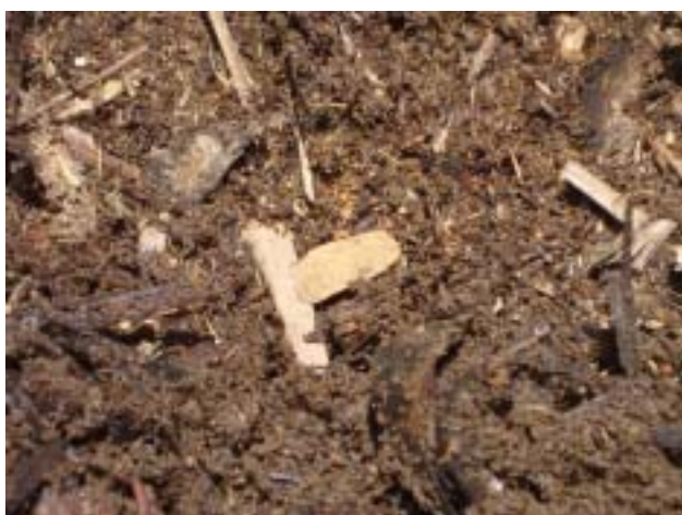
Semi Decomposed Material